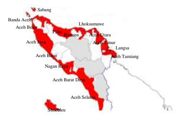
Fig. 1. The areas affected by tsunami in the Nanggroe Aceh Aceh Darussalam (NAD) province [11].

The study area is located in the northern part of the island of Sumatra, Indonesia. Aceh is one of a province in Indonesia officially named Nanggroe Aceh Darussalam. It is the western most province of the Indonesia with the Indian Ocean to the west, the strait of Malacca to the east, located between 2^0 - 6^0 North latitudes and 95^0 - 98^0 East longitudes with the area of approximately 57,365 km², or 12.26% of size of Sumatra Island. The Province of Nanggroe Aceh Darussalam is the most affected area by the tsunami of 26 December 2004. The Fig. 1, shows the areas affected by tsunami in Nanggroe Aceh Darussalam (NAD) province [11].