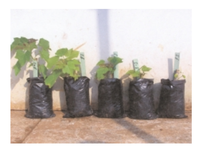
Figure 1. Growth Performance of Plant Derived from Jatropha Cuttings Irradiated with Different Doses of Gamma. From left to right: 0(control), 10, 15, 20 and 25 Gy respectively.