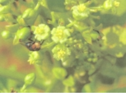
Figure 2. Fruis and flower of Jatropha curcas .