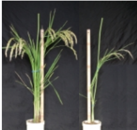
Figure 1. Phenotype of normal plant (left) and weak (right) segregated in BC_4F_2 population.

In rice, hybrid breakdown expressed as weakness in the F_2 or later generation, firstly reported by OKA [2] through observation of the progenies that was derived from crossing of some Asian varieties. This weakness was caused by complementary recessive genes, but the chromosomal locations of these genes were not known yet. The same phenomenon was also reported by OKUNO [11], KUBO and YOSHIMURA [12]. OKUNO [11] found the weakness in the F_2 or later generations in the progenies of a cross of Thai glutinous variety (Col.15) and Japanese variety, Sasanisiki. He explained that this weakness was caused by a set of recessive genes of hwd1 and hwd2 . These hwd1 and hwd2 genes were located on chromosome 10 and chromosome 7, respectively [15]. KUBO and YOSHIMURA [12] found the weakness in the F_2 or later generations in the progenies of a cross of Indica rice, IR24, and Japonica rice, Asominori. A set of complementary recessive genes of hwe1 and hwe2 that was located on chromosome 12 and chromosome 1, respectively was responsible for this weakness.